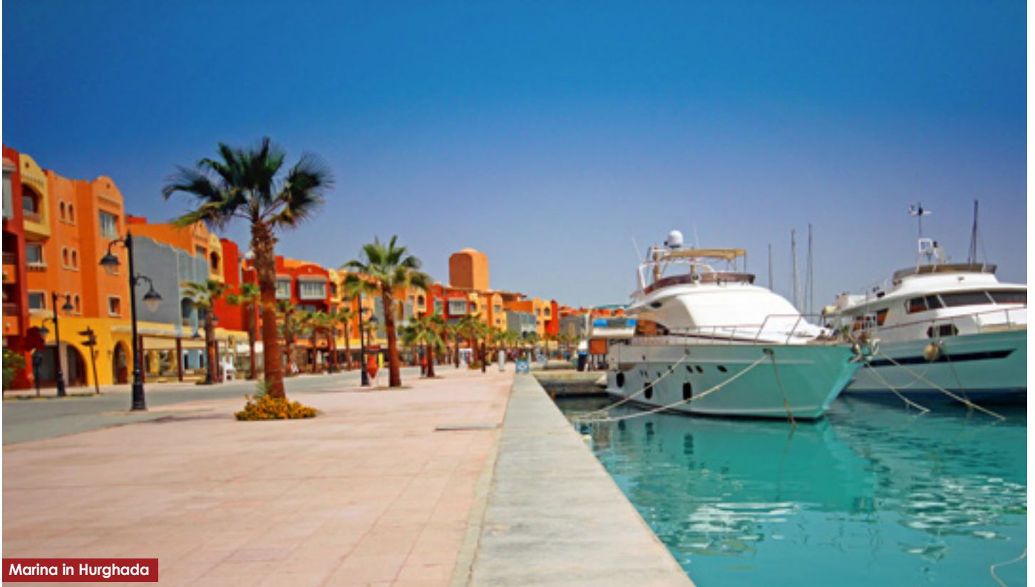
Marina in Hurghada