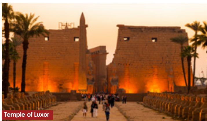
Temple of Luxor

From prices are per person, based on double occupancy. Extra nights and single occupancy are available upon request. Rates are not valid during certain holidays and blackout periods.