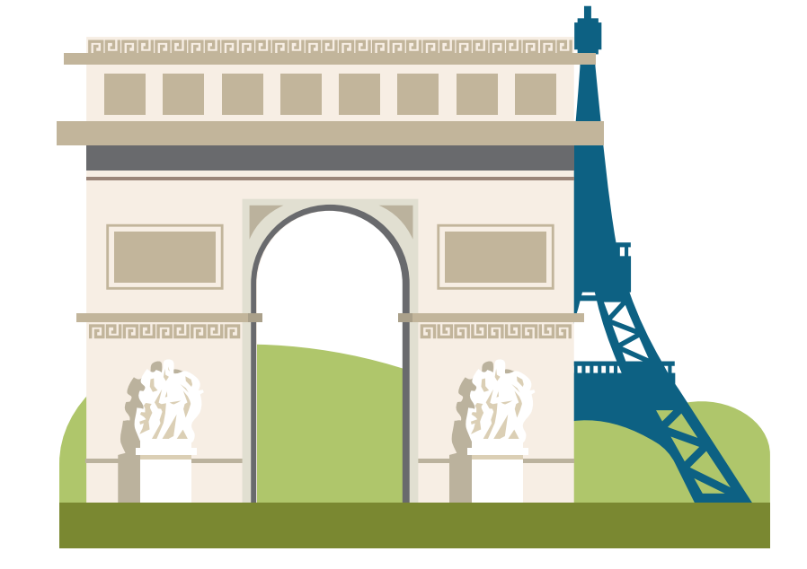
The Arc de Triomphe

Is one of the most famous monuments in Paris.