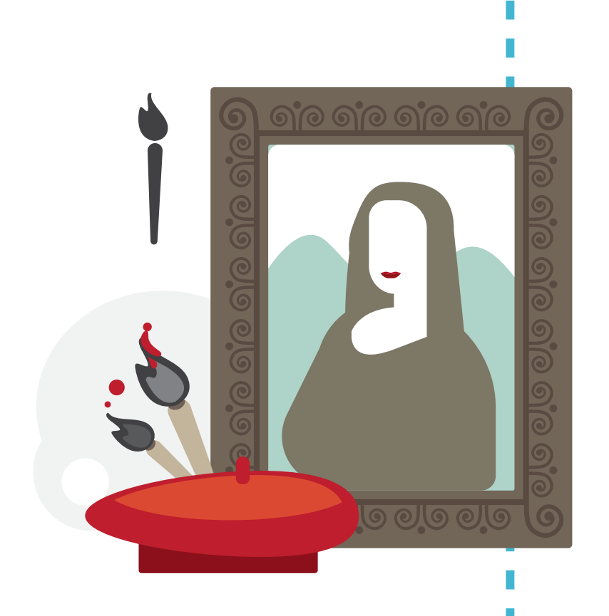
The Louvre Museum The Louvre Museum is

the world's largest art museum and a historic monument.