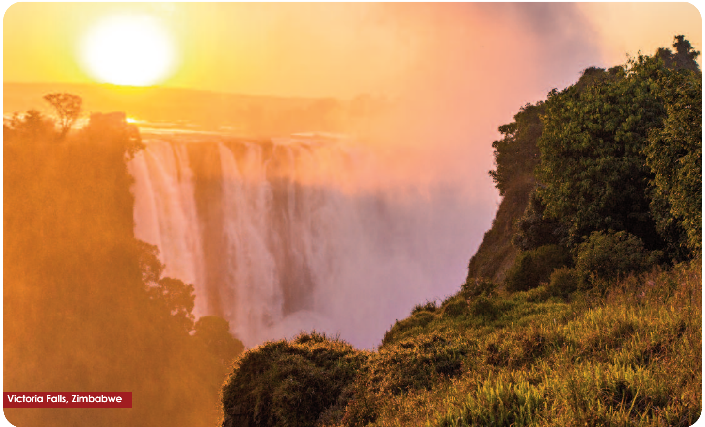
Victoria Falls, Zimbabwe