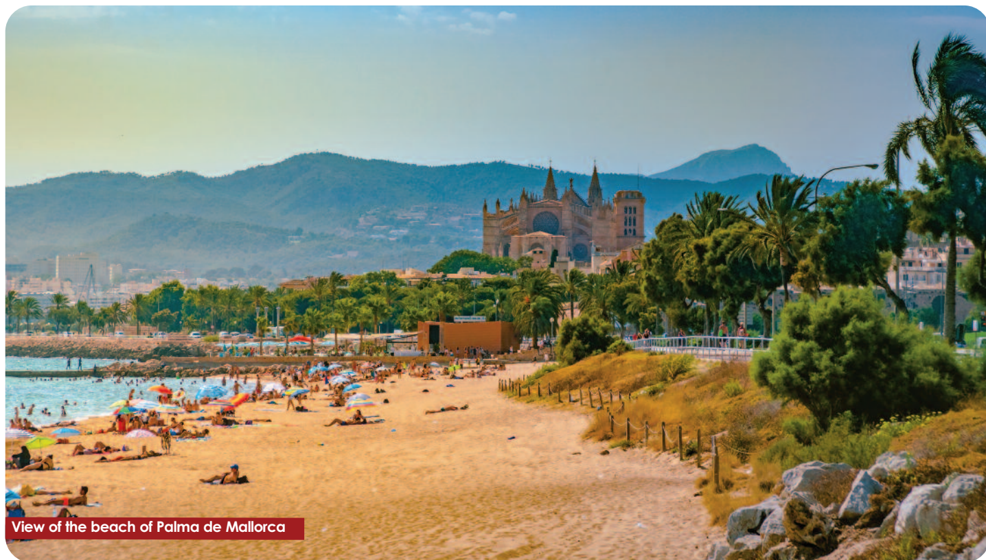
View of the beach of Palma de Mallorca