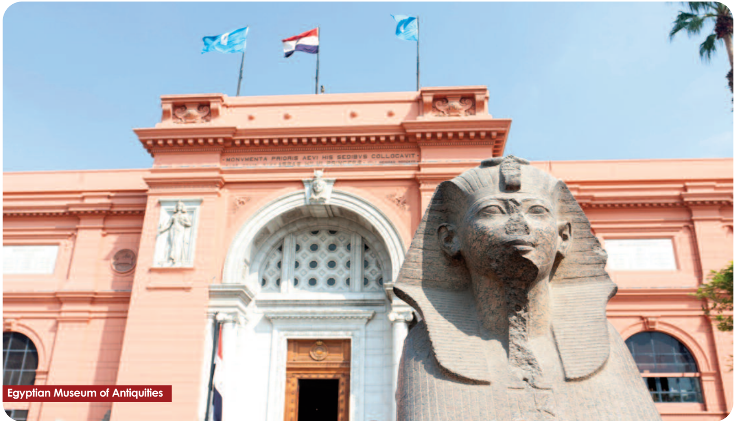
Egyptian Museum of Antiquities