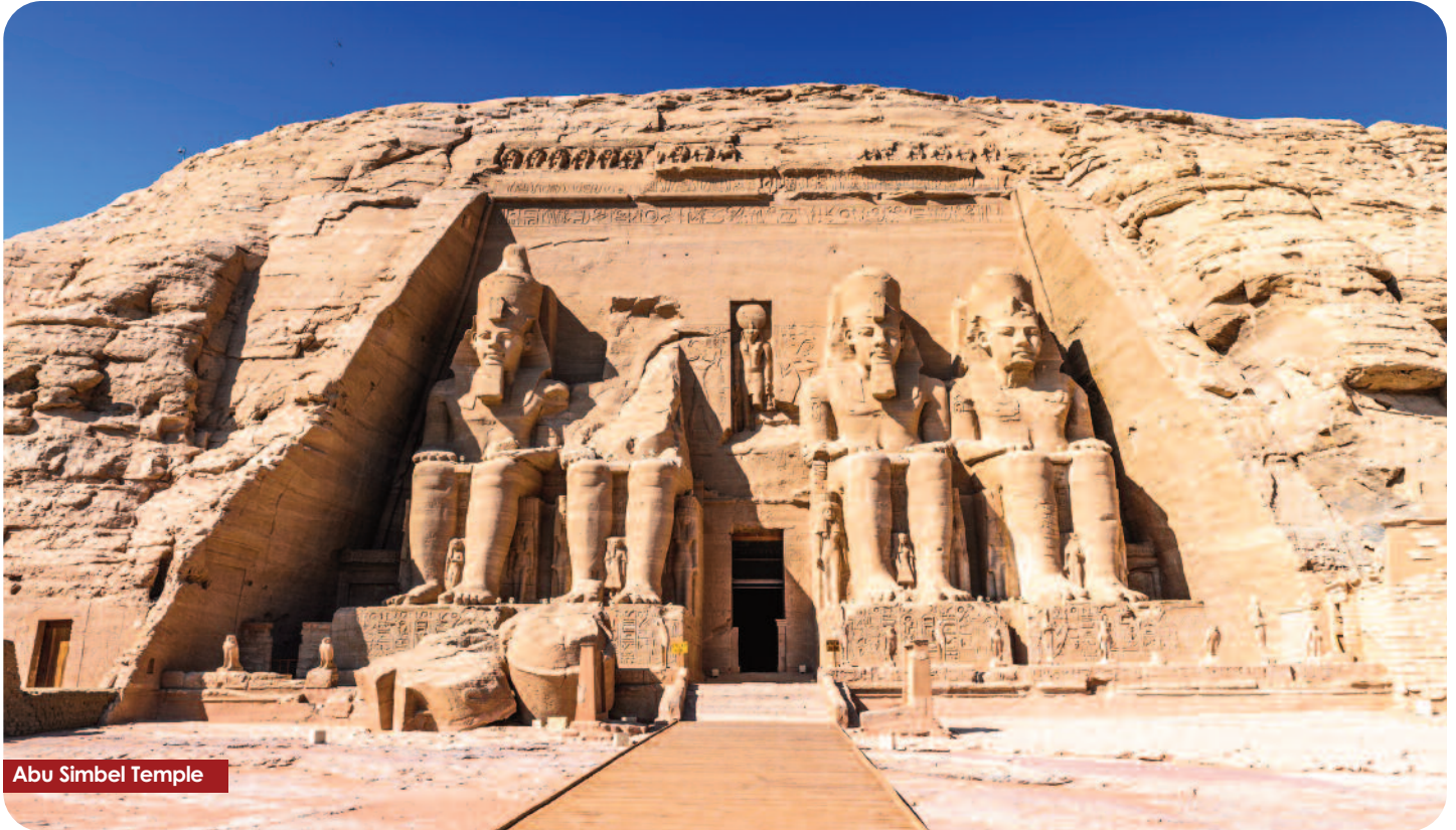
Abu Simbel Temple