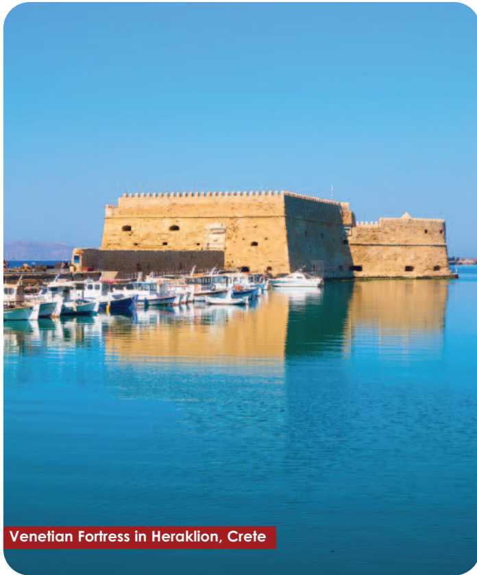
Venetian Fortress in Heraklion, Crete