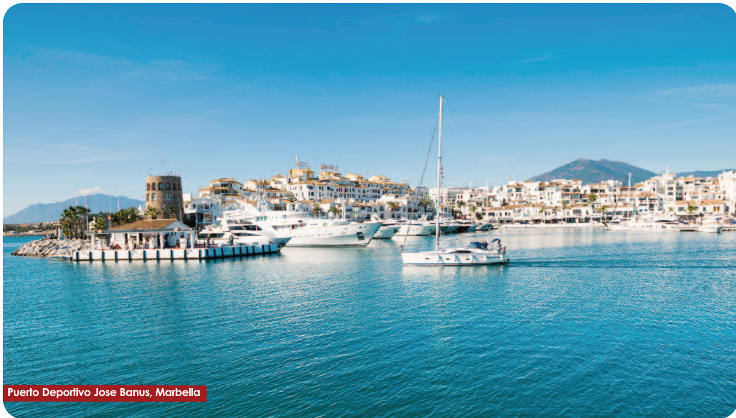
Puerto Deportivo Jose Banus, Marbella