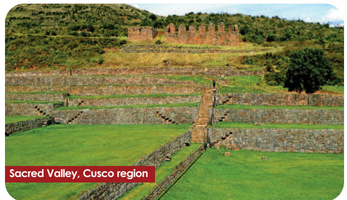
Sacred Valley, Cusco region

Cusco: JW Marriott El Convento (Classic Inca)